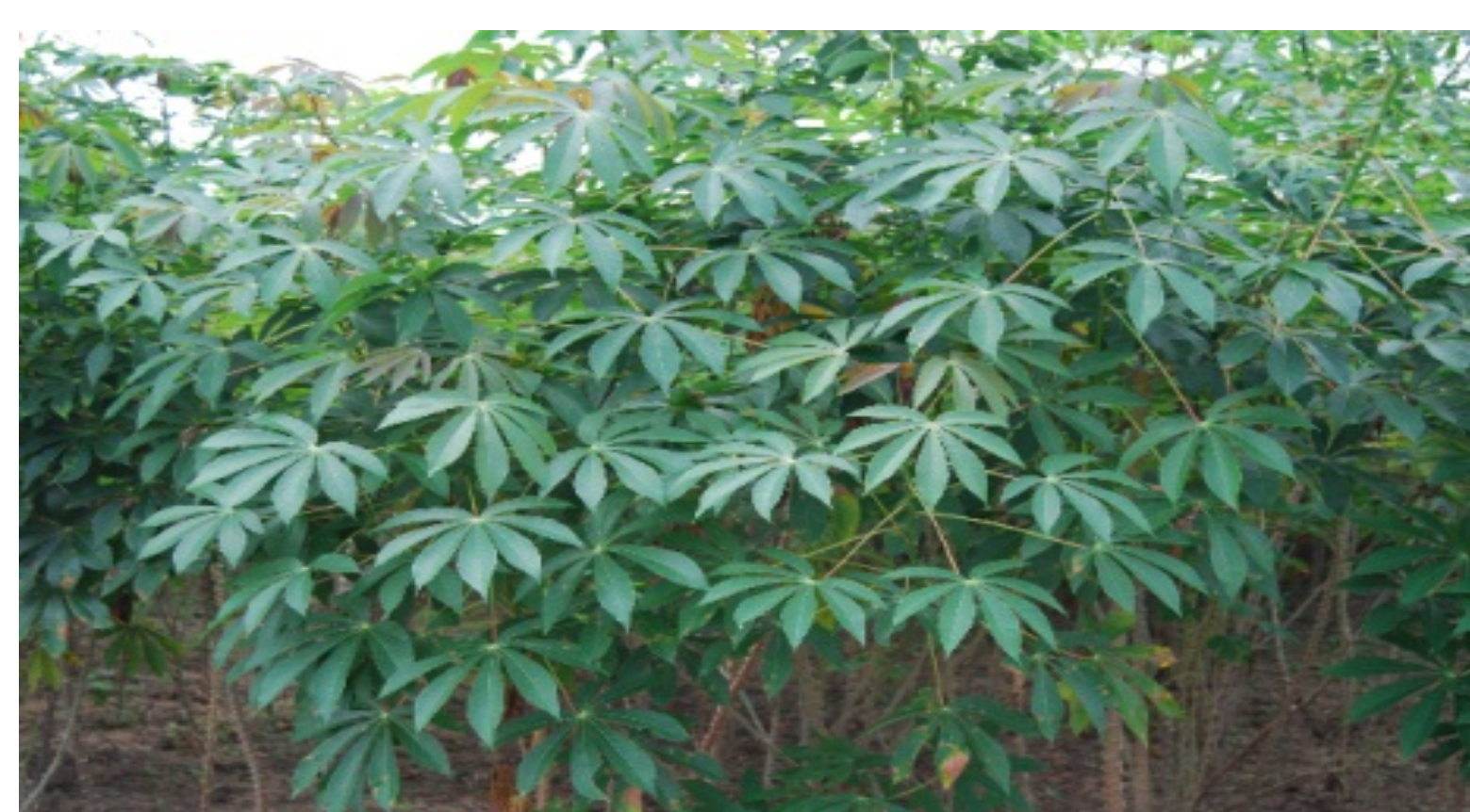
Figure 2: Cassava ( Manihot esculenta )