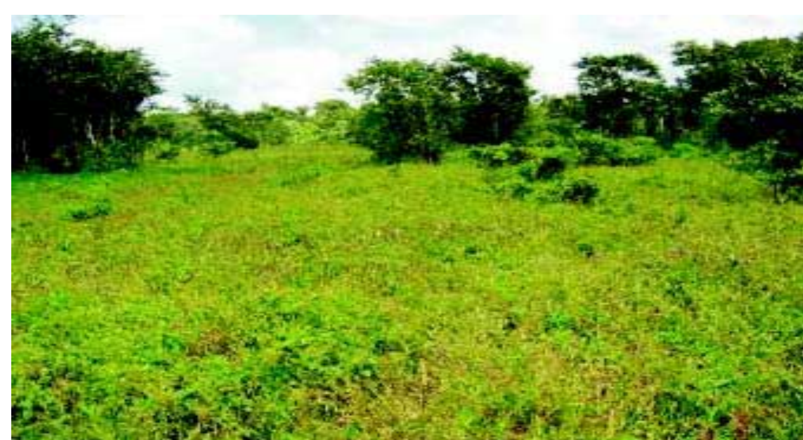
Figure 1: Capoeira (vegetation)

Statistical Analysis: Multiple regressions with quaise-Poisson error distribution, in statistical program R.